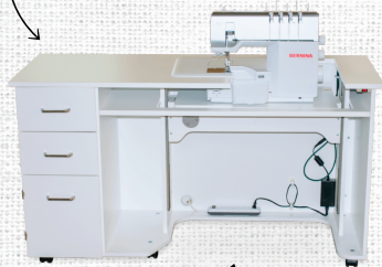
BERNINA Serger Studio