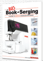
BIG Book of Serging