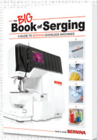
BIG Book of Serging